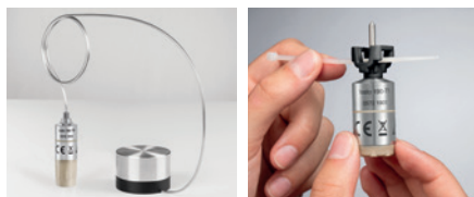
Probe holder Freeze-drying Retaining clamp

Simply safe: 100 % hermetically sealed measurement technology – even after a battery replacement.