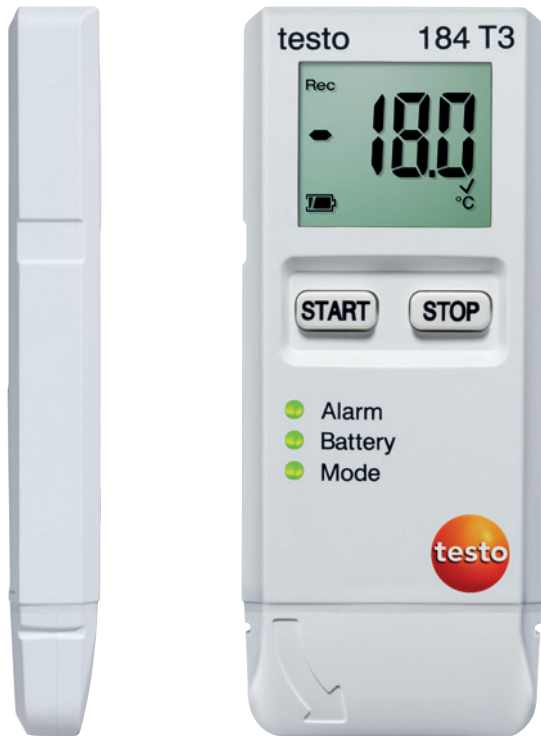
Original size image

What testo 184 series data loggers have to offer: