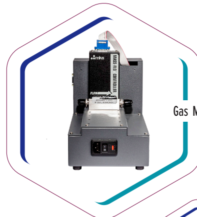
Gas Mixing Interface