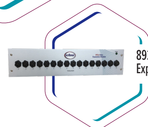
892e Data Expansion