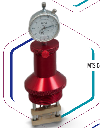
MTS Cell Head