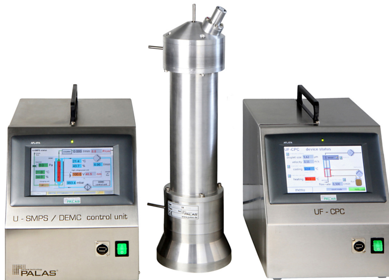
Fig. 1: U-SMPS 2050/2100/2200

The Palas® universal scanning mobility particle sizer (U-SMPS) is available in two versions. The long classifying column (2050/2100 model) is able to reliably determine particle size distributions of 8 to 1,200 nm. The Palas® U-SMPS system includes a classifier [defined in ISO 15900 as a differential electrical mobility classifier ( DEMC ) also known as a differential mobility analyzer (DMA)], in which aerosol particles are selected according to their electrical mobility and passed to the outlet.