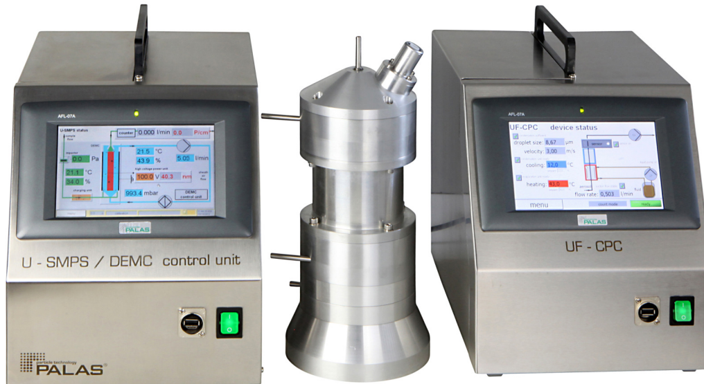
Fig. 1: U-SMPS 1050/1100/1200

The Palas® universal scanning mobility particle sizer (U-SMPS) is available in two versions. With a short classification column (1050/1100/1200 models), the U-SMPS is especially well suited for extremely precise measurements of particle size distributions within the range of 4 to 600 nm.