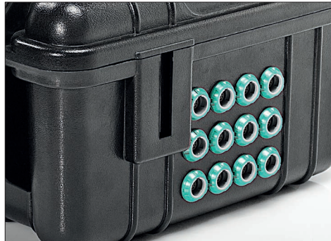
12 sensor inputs