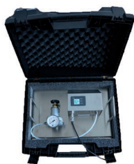
Compressed air quality measurement