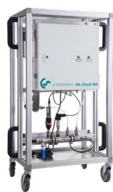
Compressed air quality measurement