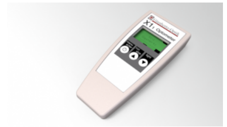
Figure 1: Mobile UV radiometer with separate measuring device and detector for measuring irradiance and dose of germicidal Hg lamps and UV-C LEDs.