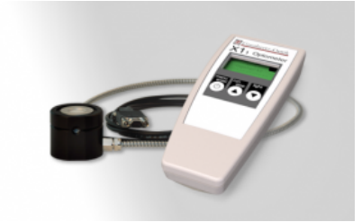
Mobile UV radiometer with separate measuring device and detector for measuring the irradiance and dose of germicidal mercury lamps.