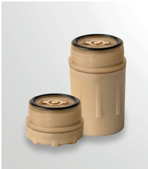
Small or large battery available