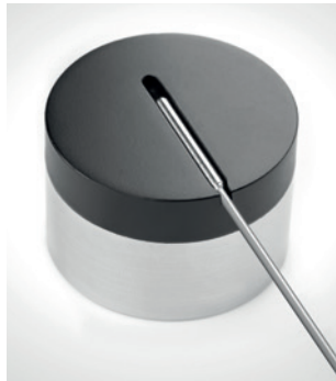
Freeze-drying probe holder (puck)