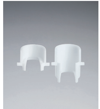
Distance adapters short / long