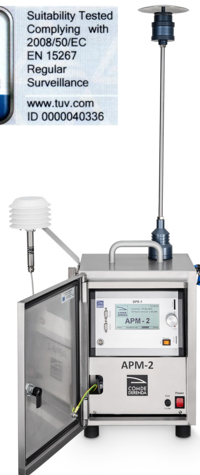
APM-2 in a stainless steel housing

Suitability Tested Complying with 2008/50/EC EN 15267 Regular Surveillance www.tuv.com ID 0000040336